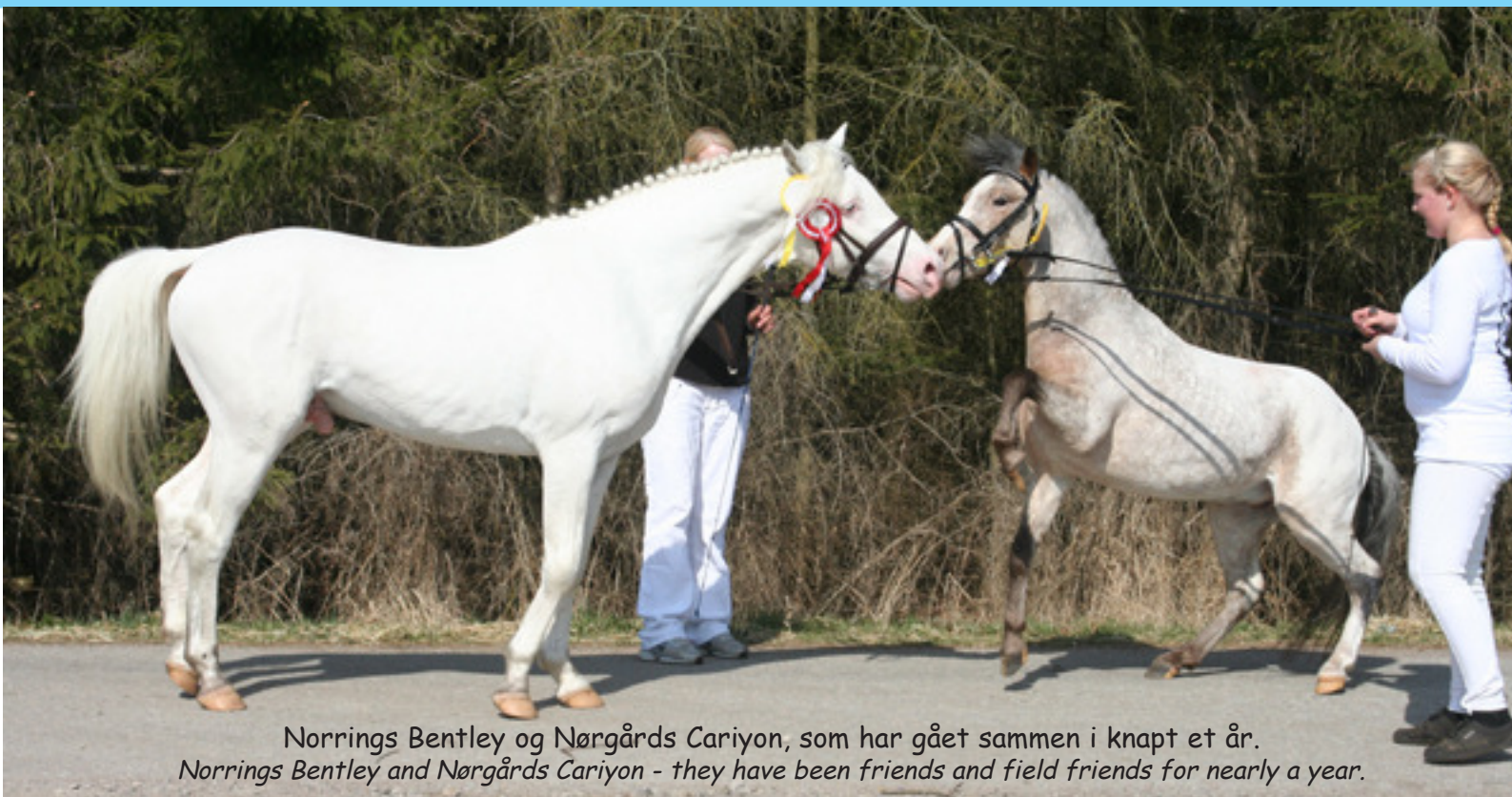
Norrings Bentley og Nørgårds Cariyon, som har gået sammen i knapt et år. Norrings Bentley and Nørgårds Cariyon - they have been friends and field friends for nearly a year.

Der er nu 2 pointsbedømmelser om året i Danmark. En om foråret og en om efteråret.