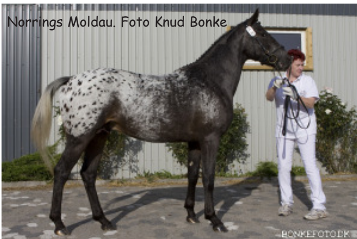
Norrings Moldau.