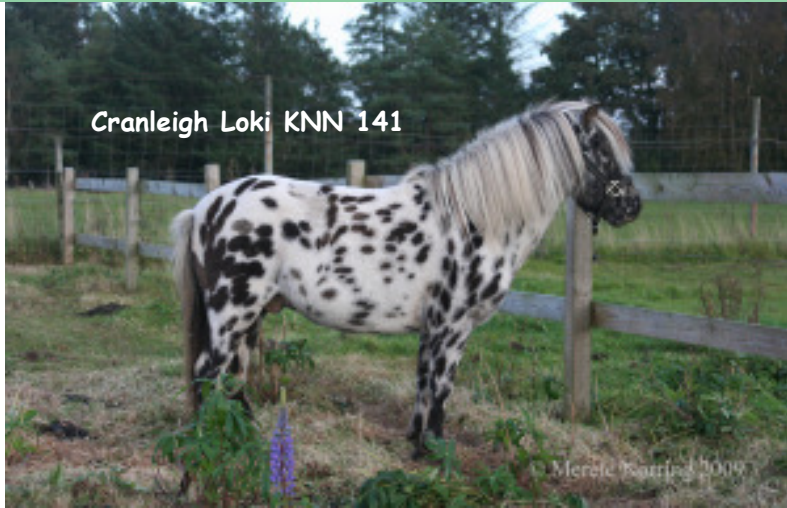
Cranleigh Loki KNN 141