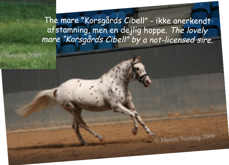
The mare "Korsgårds Cibell" - ikke anerkendt afstamning, men en dejlig hoppe. The lovely mare "Korsgårds Cibell" by a not-licensed sire.